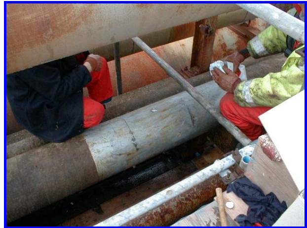
Wooden plugs used to stem flow – pipe cleaned prior to application of leak-sealing compound.