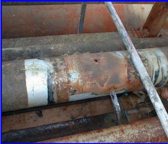
Leaks prior to repair application.

The Fast, Economical Solution for Low Pressure Pipeline Repair