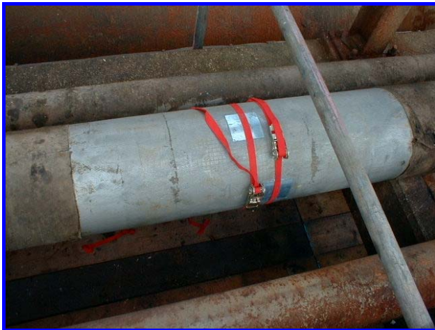
Metal-plastic compound applied and clamped in place with metal plate.